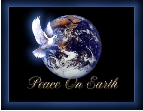
2015: Peace Begins With "We"