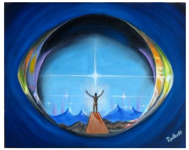
Original artwork courtesy of Ron Radhoff, 2012 I was afraid of the dark until I learned that I am Light! And the dark is afraid of me!

Manifesting Personal Peace & Empowerment