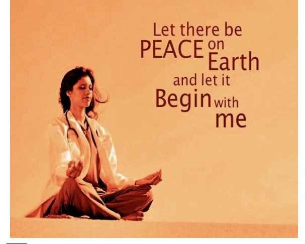
International Hour For Peace NoCo www.HourForPeace.org